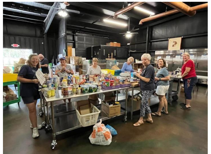
Volunteers at The Lords Food Pantry sorted 1,350 lbs. of food collected during the Stamp Out Hunger Drive. Thank you to the USPS and to the local letter carriers.

A huge thank you to the West Brunswick High School JROTC who recently collected and donated 990 lbs. of food to The Lords Food Pantry.